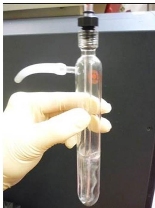
FIGURE 3 Glass bubbler with trap solution