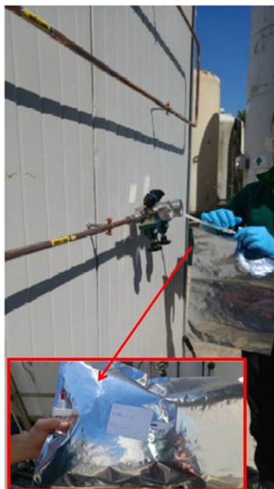
FIGURE 2 SUPELCO gas sampling bag with “screw-cap” valve

At the Laboratory of Fluid Geochemistry (Department of Earth Sciences—University of Florence, Italy), the gases stored in the Tedlar bags were gently flushed through an acidified solution by connecting, through a silicon tube, the screw-cap valve of the bags to the liquid